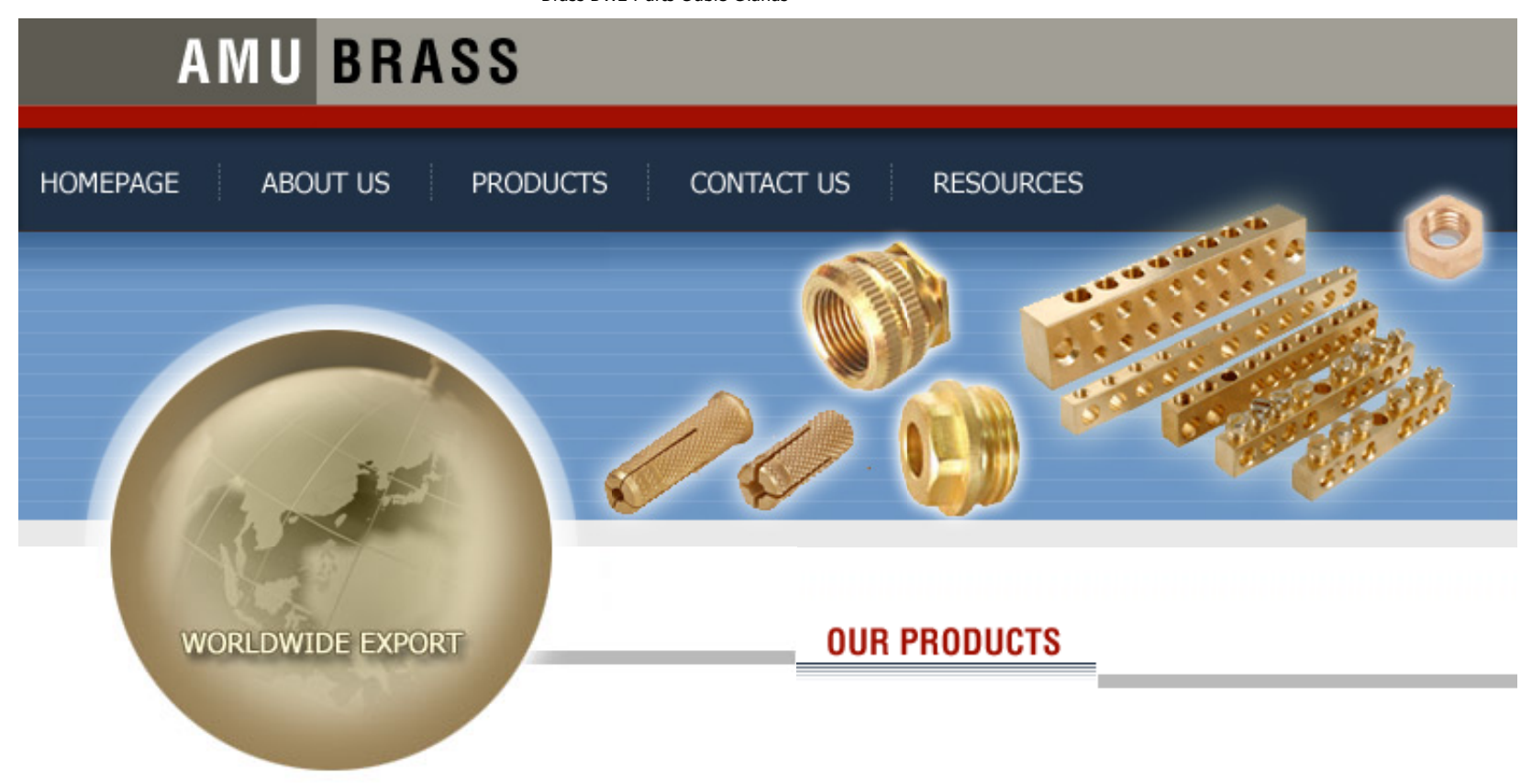
Brass BW2 Parts Cable Glands